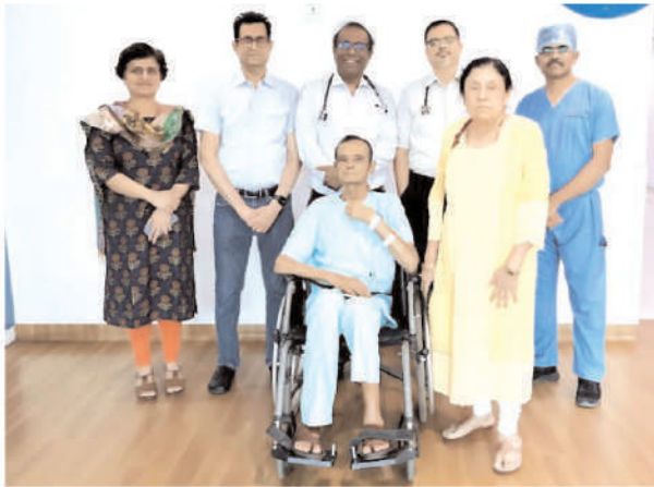
In this complex procedure, a catheter was inserted via the femoral vein, guided to the right atrium, and

ruptured chordae. 2. Functional MR - where the valve itself is structurally normal, but left ventricular dilation leads to valve leakage. For patients with Organic MR, open-heart surgery remains the standard treatment. However, in high-risk individuals especially those with multiple comorbidities such as CKD-surgical intervention may not be feasible. For such cases, the MitraClip offers a minimally invasive, catheter-based alternative that significantly reduces mitral valve leakage.