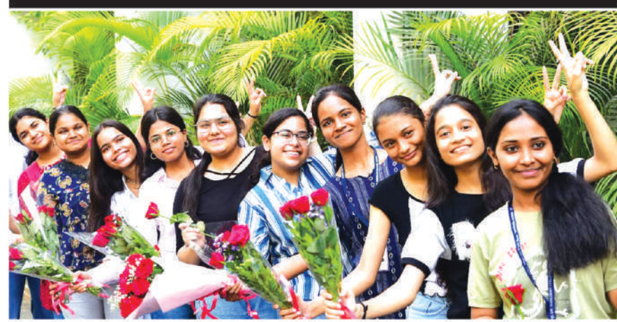
Students of an educational institution based in the second capital in celebratory mood after the declaration of class XII examination results.