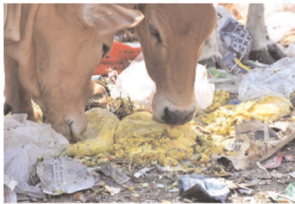
Waste food from hotels and eateries being thrown away like this and cows are in turn eating it. If cows eat too much of this kind of stale food, they become sick.

Clean city would pave the way for ending corruption, hence strategies changed