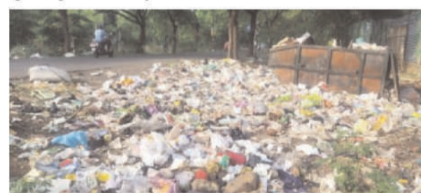
Piles of garbage in the rear of Animation College on the road stretch from Tapovan Gate to the city centre

road leading inwards from Tapovan Gate, especially the rear portion of Animation College, has piles of garbage. It has become difficult for the citizens here to breathe, and the stench is adversely affecting their health. A similar situation was observed in the Sarvagya Book Centre area