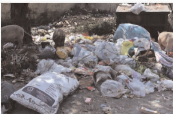
Garbage accumulated in vicinity of crematorium in Shankar Nagar

Amravati 9 June (NAGPUR POST/DC): About five years ago, all the main road stretches in the city were made of asphalt and gravel. Today, if a layer of oil-mixed asphalt was laid on the road, the road would be as it was in the next six months, the same contractor would get the contract to repair that road stretch and he would again lay a layer of oil-mixed asphalt on this road. Due to this, the contractor would get work for twelve months and the officials in turn would get the commission. Now, due to the concrete road, this collusion between contractors and officials has stopped. Due to this, a new scheme of earning money from garbage has been initiated in the city. If the city is kept clean, this chain of corruption will be broken in fact. Information has come to the fore that certain