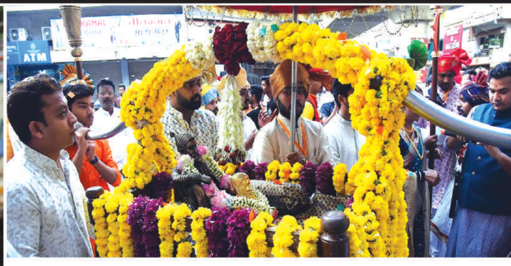
A large number of people gathered to witness the celebrations of 351st anniversary of Chhatrapati Shivaji Maharaj's coronation, at Shivaji Maharaj Chowk, Mahalin Nagpur, Monday