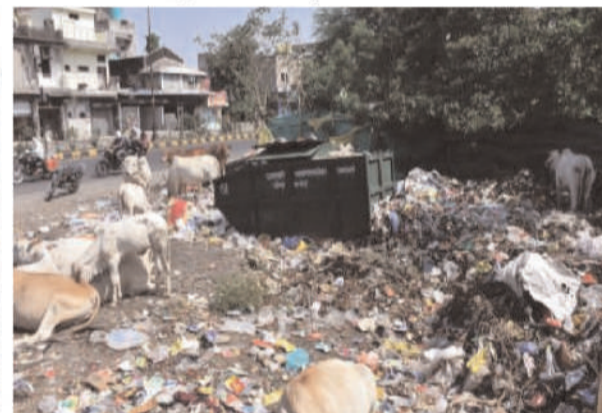
Garbage piled up in this way in the vicinity of cow shelter in Dastur Nagar

The piles of garbage and accumulated dirt from Moti Nagar to Farshi Stop road, as well as the service line in the Subhash Nagar area, are endangering the health of the citizens. In the Shankar Nagar area, a large amount of garbage has been accumulated in the vicinity of the crematorium. From there, garbage has spread from Dastur Nagar to Badnera Bypass Road, in the vicinity of Gaurakshan, and also on the road stretch leading to Chhatra Lake. The