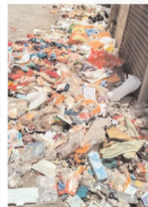
Garbage accumulated in vicinity of Gandhi Square, Sarvagya Book Depot