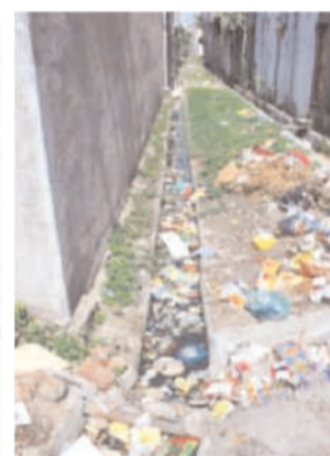
Service lines from Moti Nagar to Farshi stop in Subhash Nagar filled with garbage in this way