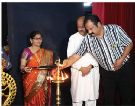
anniversary of coronation of Shivaji Maharaj