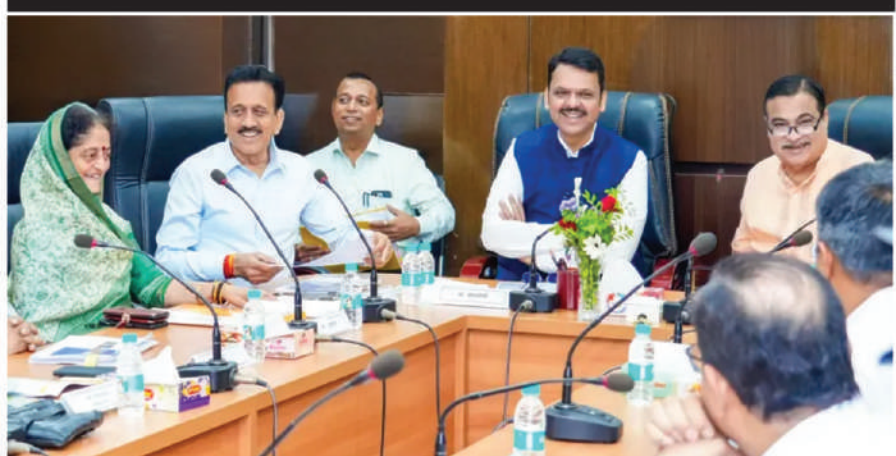
CM Fadnavis, along with Union Minister Nitin Gadkari, chaired a review meeting on the Nag River Pollution Abatement Project in Nagpur on Sunday.