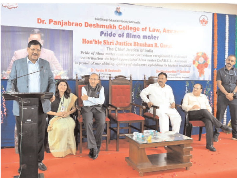
Chief Justice of India Bhushan Gavai said, I am a student of 'Dr. Panjabrao Deshmukh College of Law'. I got a lot of support from the institution while pursuing my legal education. I am indebted to this college. In the coming times also, the work of administering justice will continue under my supervision within the framework of the Indian Constitution. We will continue to serve the country relentlessly.