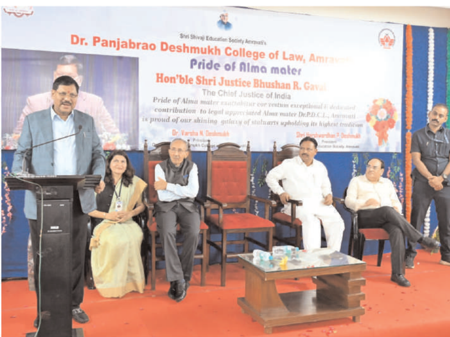
Chief Justice of India Bhushan Gavai said, I am a student of 'Dr. Panjabrao Deshmukh College of Law'. I got a lot of support from the institution while pursuing my legal education. I am indebted to this college. In the coming times also, the work of administering justice will continue under my supervision within the framework of the Indian Constitution. We will continue to serve the country relentlessly.