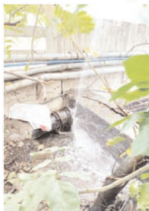
concerned water pipeline supplies water to the entire Mozari and Gurudev Nagar

Tiwasa 26 June (NAGPUR POST/TC): The water pipeline in the vicinity of the old rural hospital underpass in Tiwasa town has been leaking for the past several days and lakhs of litres of water are flowing into the ground. The water pipeline in question is meant for providing water supply to (Gurudev Nagar) and comes under the jurisdiction of the Gram Panchayat. Even though the leak in the incoming water pipeline has been taking place for the past several days, it has not been repaired yet due to the negligence of the Gram Panchayat authorities. The