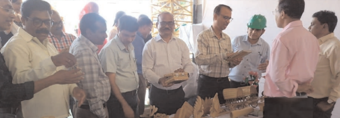
An exhibition of eco-friendly bamboo products and sanitary pad vending machines was organised on behalf of SECR as part of Environment Fortnight 2025 observances. The exhibition evoked enthusiastic response.