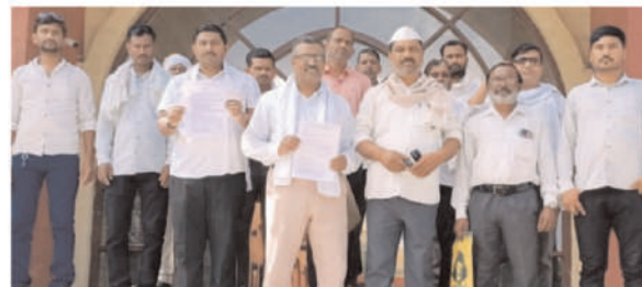
Office bearers and activists of Kisan Adhikar Abhiyan with the copies of Memorandum

Wardha 4 June (NAGPUR POST/DC): Kisan Adhikar Abhiyan, Wardha-an organization working for the rights of farmers, laborers, women, and workers, submitted a memorandum to the District Collector and demanded to include those families who are holding ration cards issued after 2019 under the Ayushman Bharat Pradhan Mantri Jan Arogya Yojana (PM-JAY).