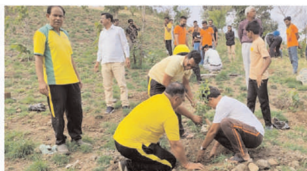
Members of VJM rendering their services at clean-up and tree plantation drive on World Environment Day

Wardha 5 June (NAGPUR POST/DC): Marking World Environment Day, the Vaidyak Jan Jagruti