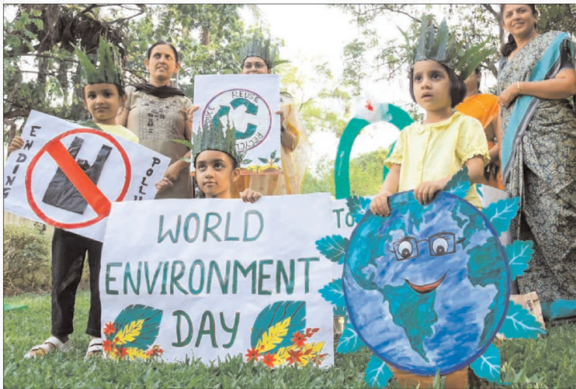
Members of Nagpur Garden Club propagated the message of 'Save Environment, Save Trees' on the occasion of World Environment Day.