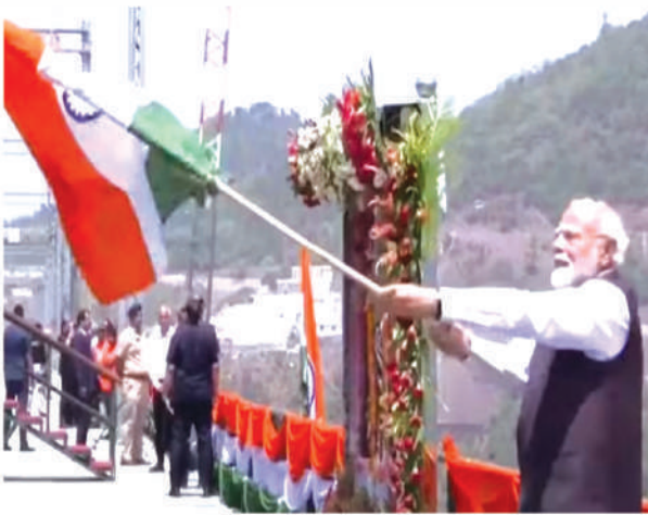
the mainland. Just weeks after the deadly Pahalgam terror attack, the inauguration of multiple all-weather infrastructure projects in Kashmir served

Jammu 6 June: In a major infrastructure milestone for Jammu and Kashmir, Prime Minister Narendra Modi on Friday inaugurated the Chenab Rail Bridge, the world's highest railway arch bridge. The engineering marvel is a key part of the Udhampur-Srinagar-Baramulla Rail Link (USBRL) project and now seamlessly connects the Kashmir Valley to the rest of India via rail. PM Modi's visit today marked several firsts for the region as well: the inauguration of India's first cable-stayed railway bridge, Anji Khad Bridge, and the first-ever train service directly linking Kashmir to the mainland. Just weeks after the deadly Pahalgam terror attack, the inauguration of multiple all-weather infrastructure projects in Kashmir served