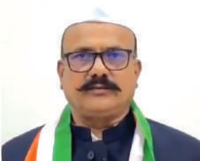
Mumbai 8 June: